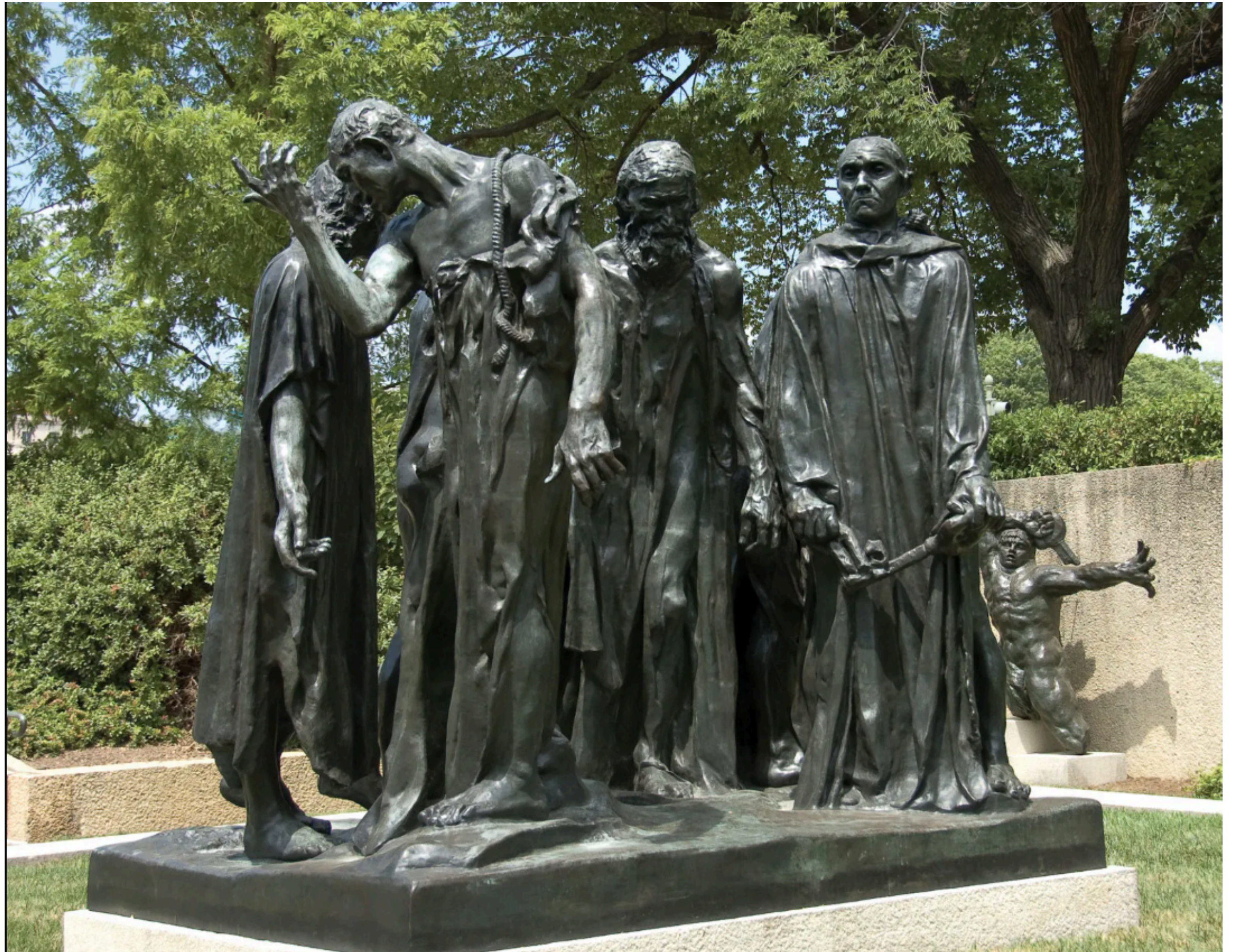
Auguste Rodin: The Burghers of Calais